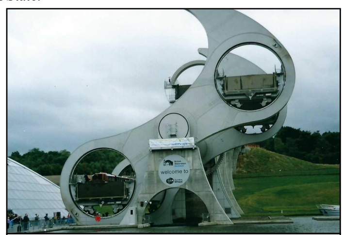
The Falkirk Wheel. See it in motion by clicking: www.scottishcanals.co.uk/falkirk-wheel/about-the-wheel/how