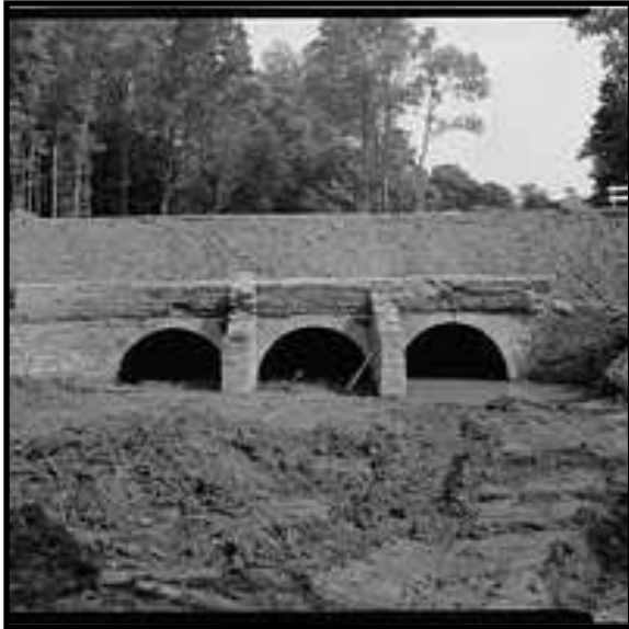
Six Mile Run culvert.

Mr. Sellar reported that the contract for the project to rehabilitate the canal embankment downstream of the Island Farm Weir (DRCC #19-4584C) was awarded and that work would commence in early November.