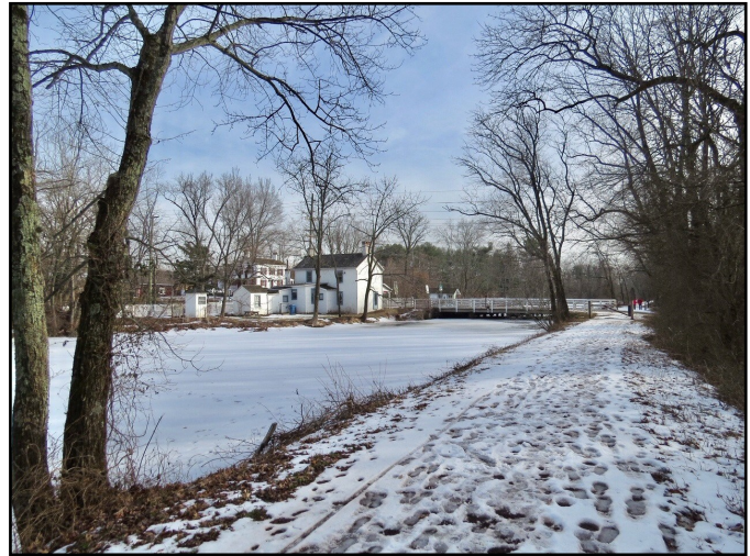
Winter at Blackwells Mills by Todd Murphy

I meet nothing but pairs -- cross-country skiers cardinals (already!) in a shrub beside the iced canal man&dog/girl&dog even the Towpath --half thawed/half-glazed-- is made for two the one of me takes the thawing way