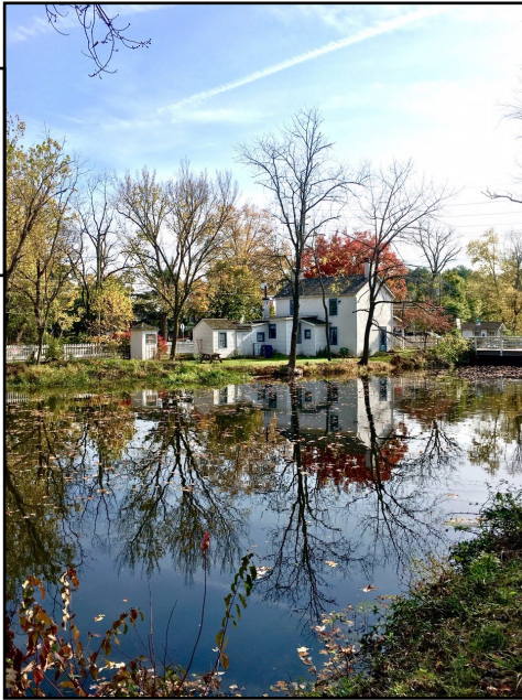
Blackwells Mills bridge-tender's home reflected in the canal, by Todd Murphy

Here are four examples from previous years: