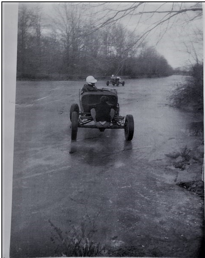
RACEING ON THE FROZEN CANAL AT BLACKWELL

South of Stockton, more clay was added to the embankment at the Brookville waste gate.