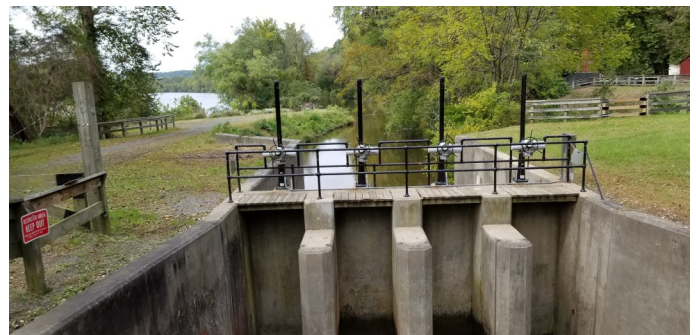
Prallsville guard lock