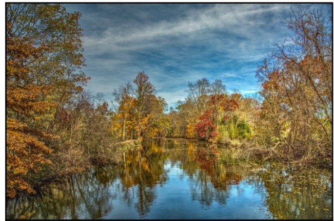
Reflections by Tom Egan