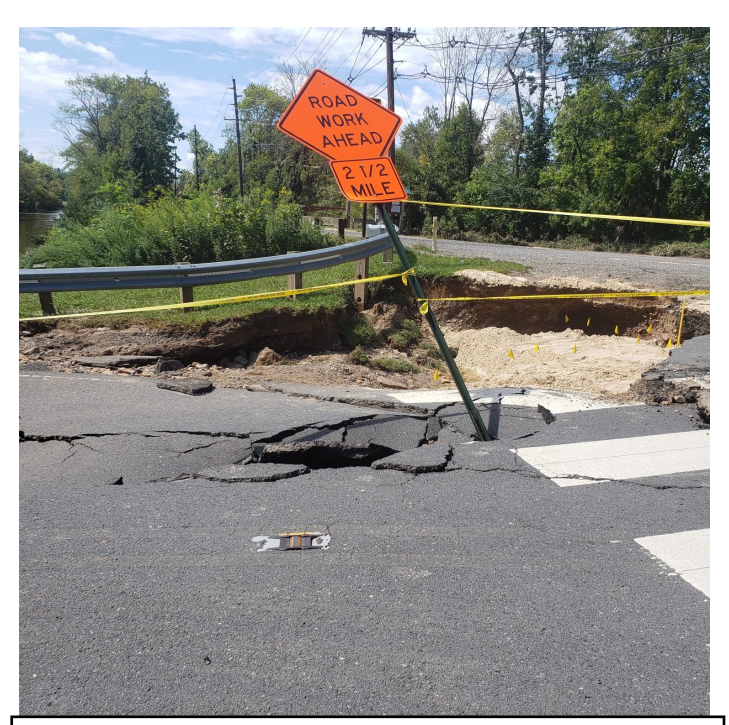
A sinkhole on Quakerbridge Road near the canal in Port Mercer