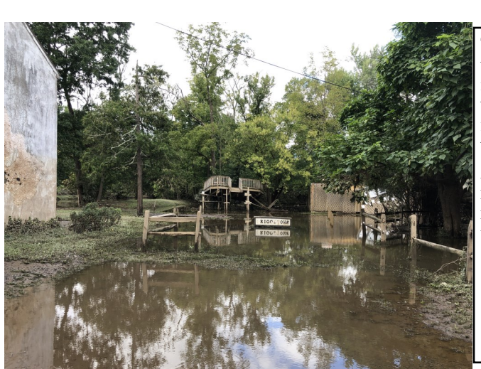
The back deck of the visitor center in Griggstown was torn off and floated toward the canoe livery.