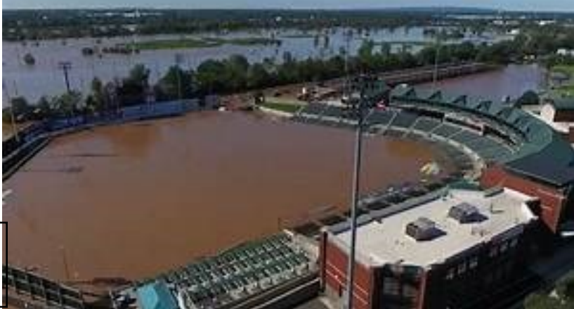
The TD Bank Ballpark in Bridgewater, just across the Raritan River from the canal in South Bound Brook.