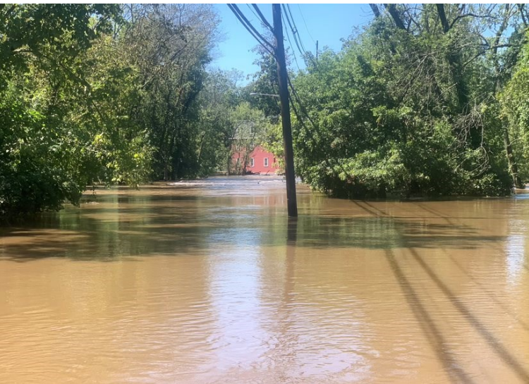
Kingston, September 3. Photos by Charles Martin Top two: parking lots at the Kingston lock. Lower left: road leading to the mill.

Rocky Hill, September 3: Photos by Charles Martin Bottom an lower left: Route 518 crossing the canal and river