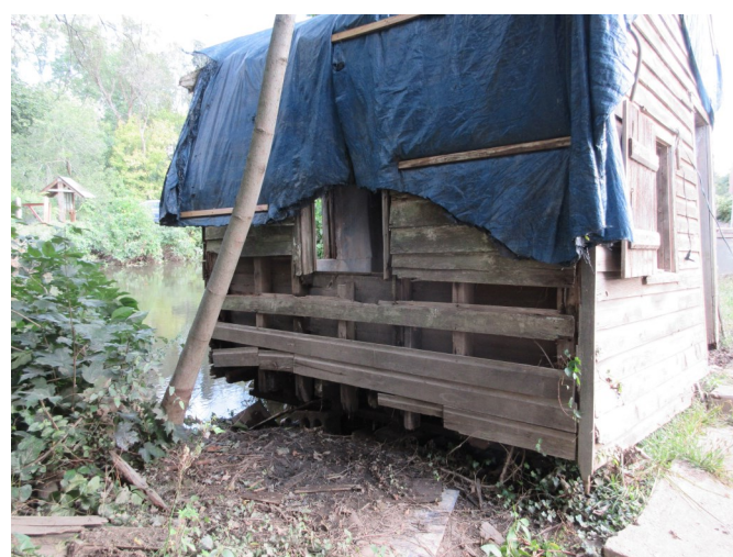
Our East Millstone bridgetender's station survived quite well inside and out. Our team power washed the interior.