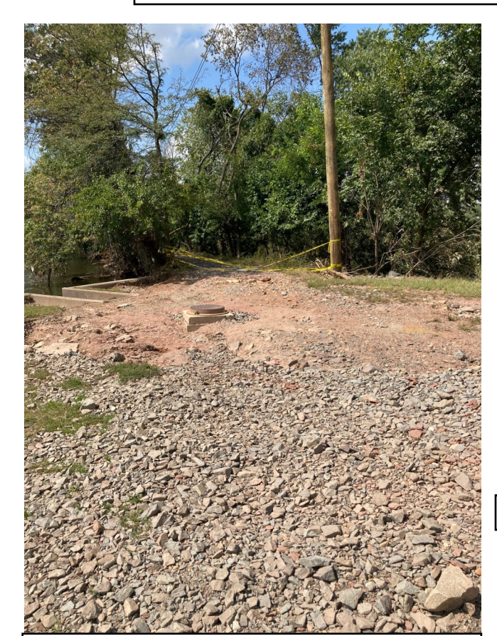
South Bound Brook towpath heading south from Lock 11.