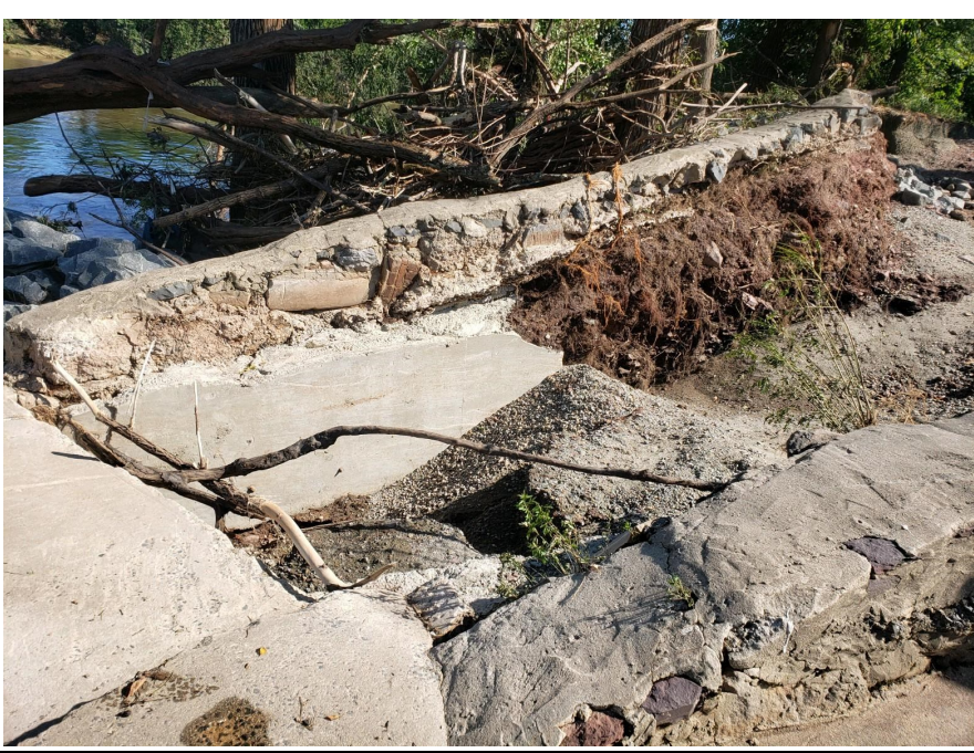
South Bound Brook spillway and towpath.