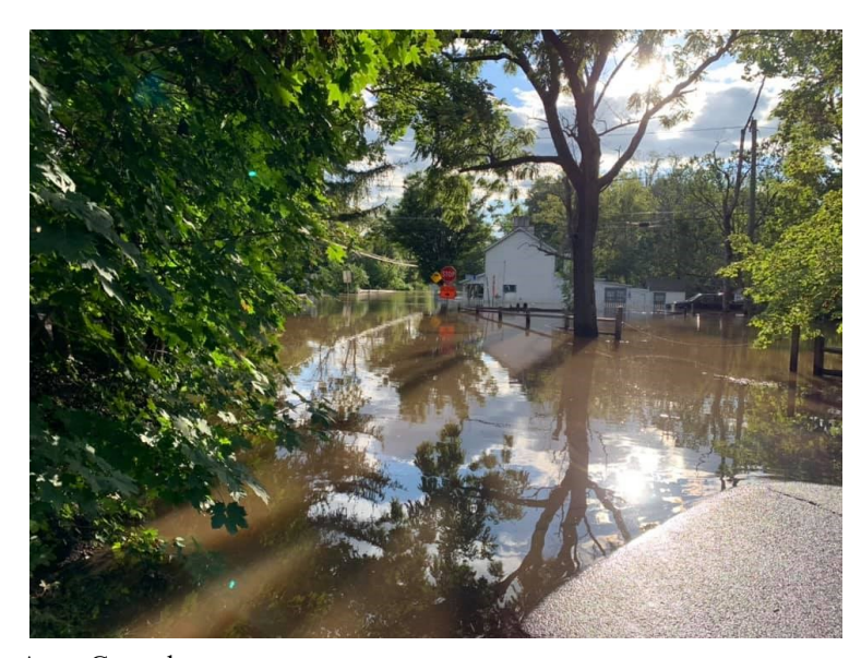
Blackwells Mills.