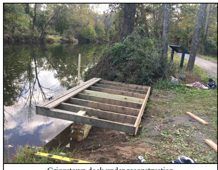
Griggstown dock under reconstruction

The D&R Canal ran 44 miles from Bordentown on the Delaware River to the Raritan River at New Brunswick and an additional 22 miles along its feeder between Bull's Island and Trenton. Except for a small section through Trenton, the rest of the canal is open for walking, running, or biking along its towpath, or paddling through its waters.