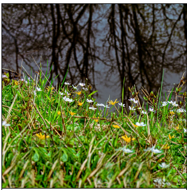
Lovely flowers bloom along the canal in Griggstown.

The D&R Canal Watch P.O. Box 2 Rocky Hill, New Jersey 08553 908-240-0488 www.canalwatch.org https://www.facebook.com/dandrcanalwatch/info@canalwatch.org