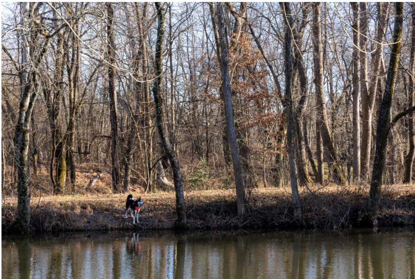
Dog on the towpath in Kingston