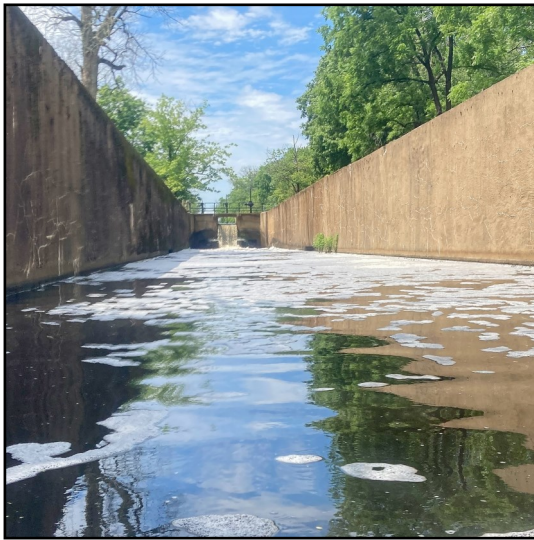
Lock 10 near Zarephath