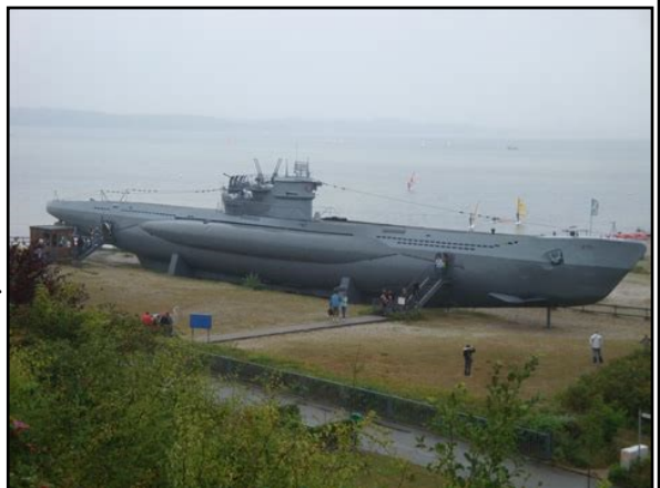
German U-boat.