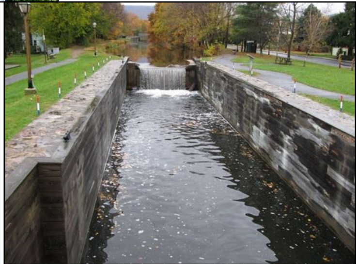
Lehigh Canal lock at Walnutport, Pennsylvania

Though still firmly in charge of the railroad, Packer's later years were dedicated to philanthropy. Recognizing the need to train American engineers, he founded Lehigh University with a bequest of $500,000 and land; later he donated $400,000 to build the Linderman Library at Lehigh in memory of his daughter. In 1876, he donated land for the Lehigh Valley's first hospital, St. Luke's, and endowed it with $300,000. Packer died in Philadelphia on May 17, 1879; generous bequests in his will sustained his support of these and other institutions long afterward.