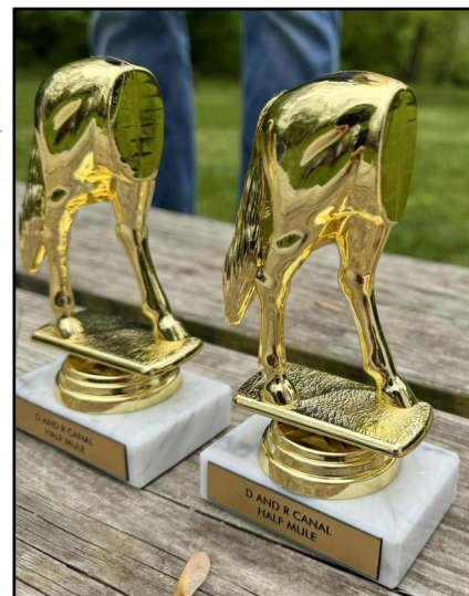
Half-mule prizes for the Half "Mule-Day" Race

The race was a great addition to the 50th anniversary celebration and we hope to make this an annual event.