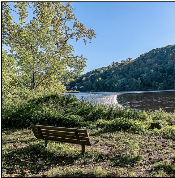
Overlooking the Wing Dam at Bulls Island, by Summer Praner