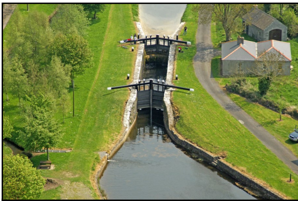
Royal Canal Lock 35 near Ballynacarrigy, County