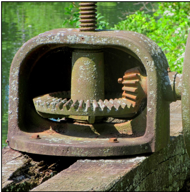
Actuator downstream of Lock 10.

We will send out an email blast when the calendar is back from the printer and let you know how to get your copy.