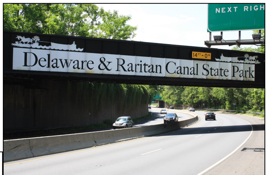
State Park sign on bridge over Route 1 in Trenton

Union County: Plainfield, Union Township, Elizabeth, New Providence, Plainfield, Summit, and Clark.