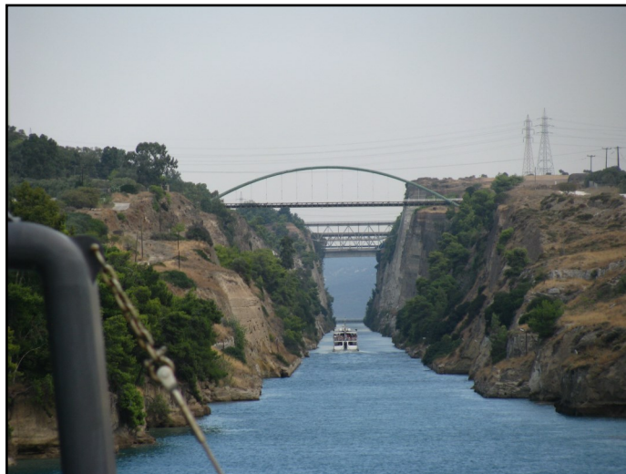
Corinth Canal, Greece

Lawrence River and the Great Lakes or south to the Gulf of Mexico and the Mississippi. A third possibility was the linking of the Great Lakes with the Hudson via the Mohawk Valley. The Erie Canal, 363 miles long with 82 locks from Albany on the Hudson to Buffalo on Lake Erie, was built by the state of New York from 1817 to 1825. Highly successful from the start, it opened up the Midwestern prairies, the produce of which could flow eastward to New York City, with manufactured goods making the return journey westward, giving New York predominance over other Atlantic Seaboard ports.