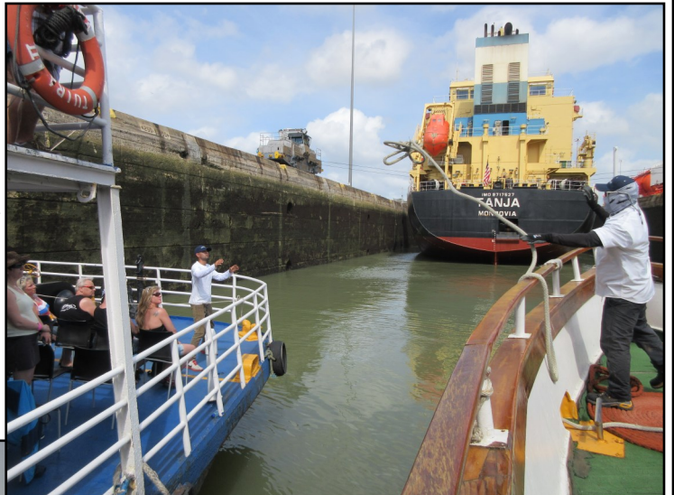
Inside a lock on the Panama Canal.

In the United States, canal building began slowly. Only 100 miles of canals had been built at the beginning of the 19th century, but before the end of the century more than 4,000 miles were open to navigation. Hauling cargo by wagon was difficult, slow, and costly, so water transport was the key to the opening up of the interior, but the way was barred by the Allegheny Mountains. To overcome this obstacle, it was necessary to go north by sea via the St.