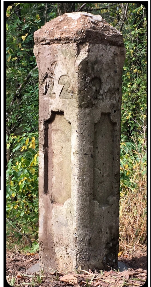
This fancier version shows the halfway point, near Rocky Hill