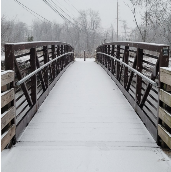
Pedestrian bridge at Demott Lane

As usual, we have included a map and a history of the D&R Canal.