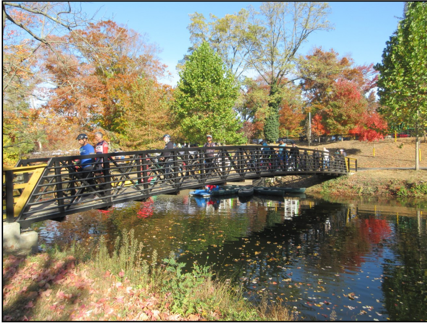
Bikers cross the pedestrian bridge en route to the starting line.

Nonprofits and other agencies staffed tables, offering free as well as sales items. These included Trenton City Parks, New Jersey American Water, Capital Health, New Jersey Future, New Jersey Conservation Foundation, Delaware Riverkeeper Network, and, of course the D&R Canal Watch.